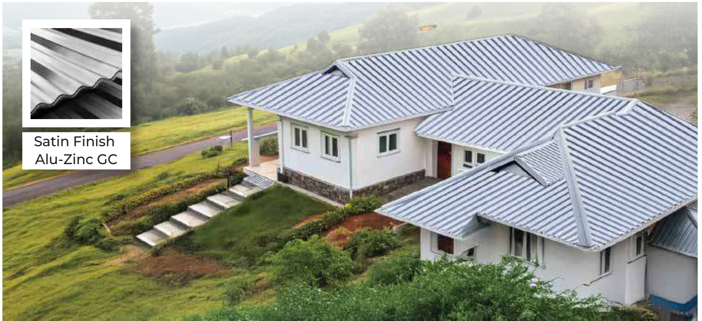
Satin Finish Alu-Zinc GC